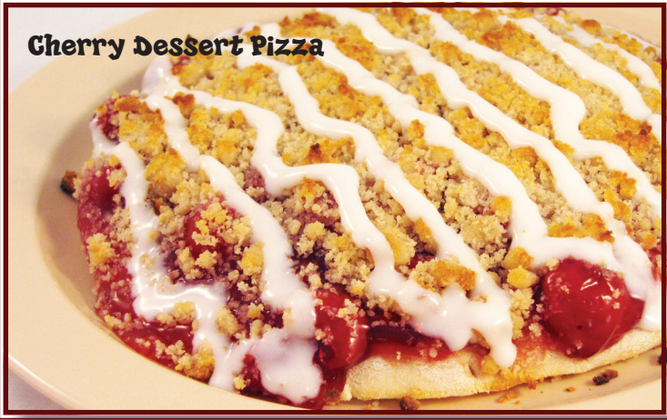
Cherry Dessert Pizza