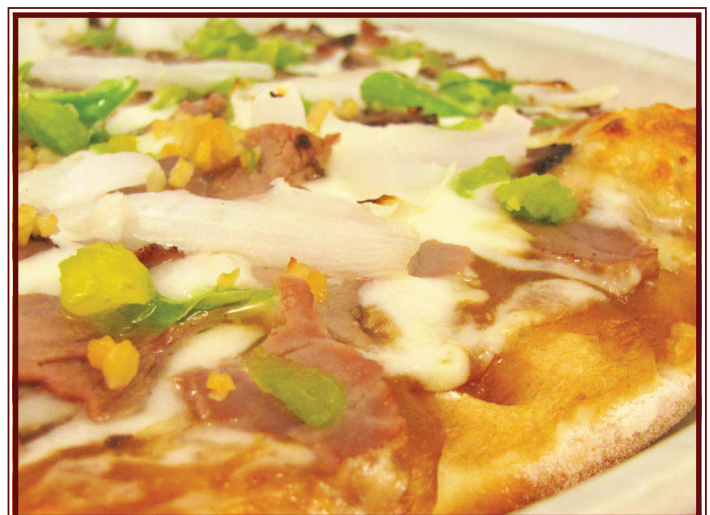
Philly Cheese Steak Pizza