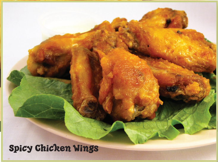
Spicy Chicken Wings