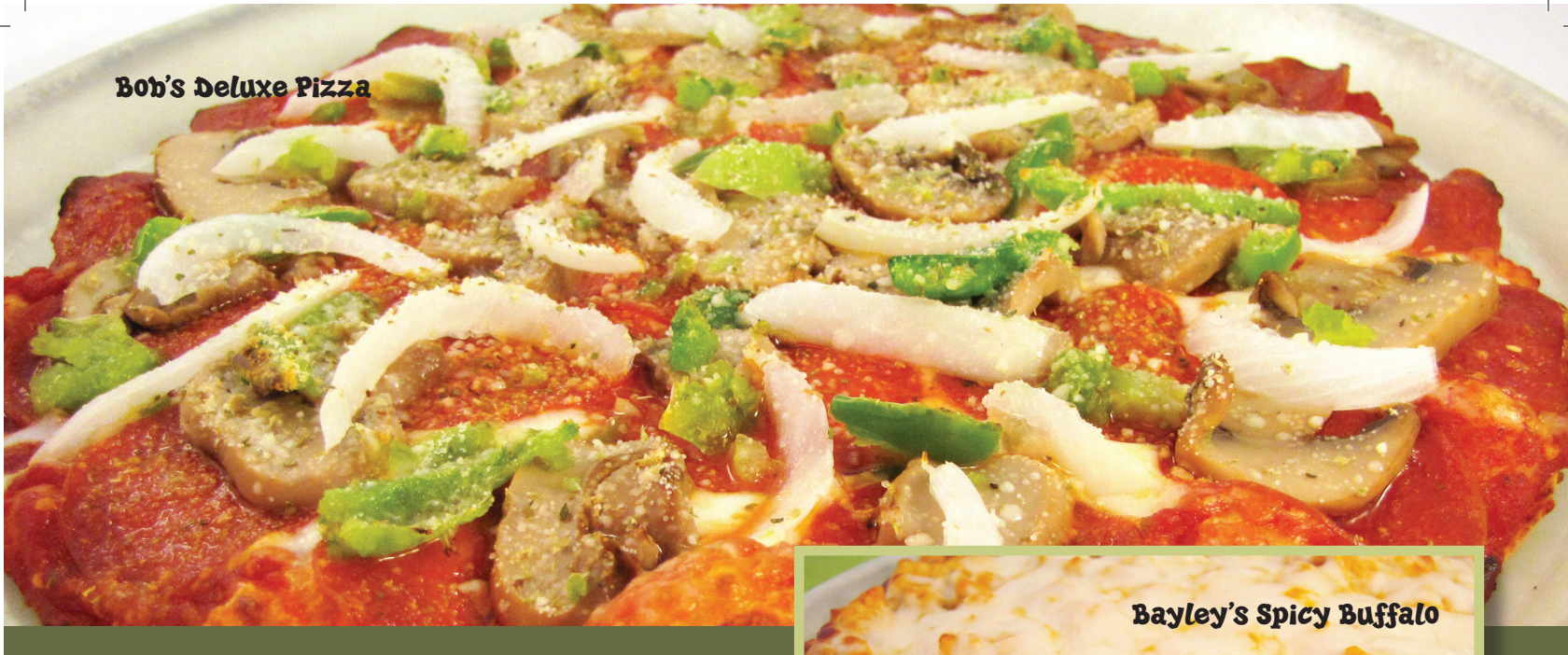
Bob's Deluxe Pizza