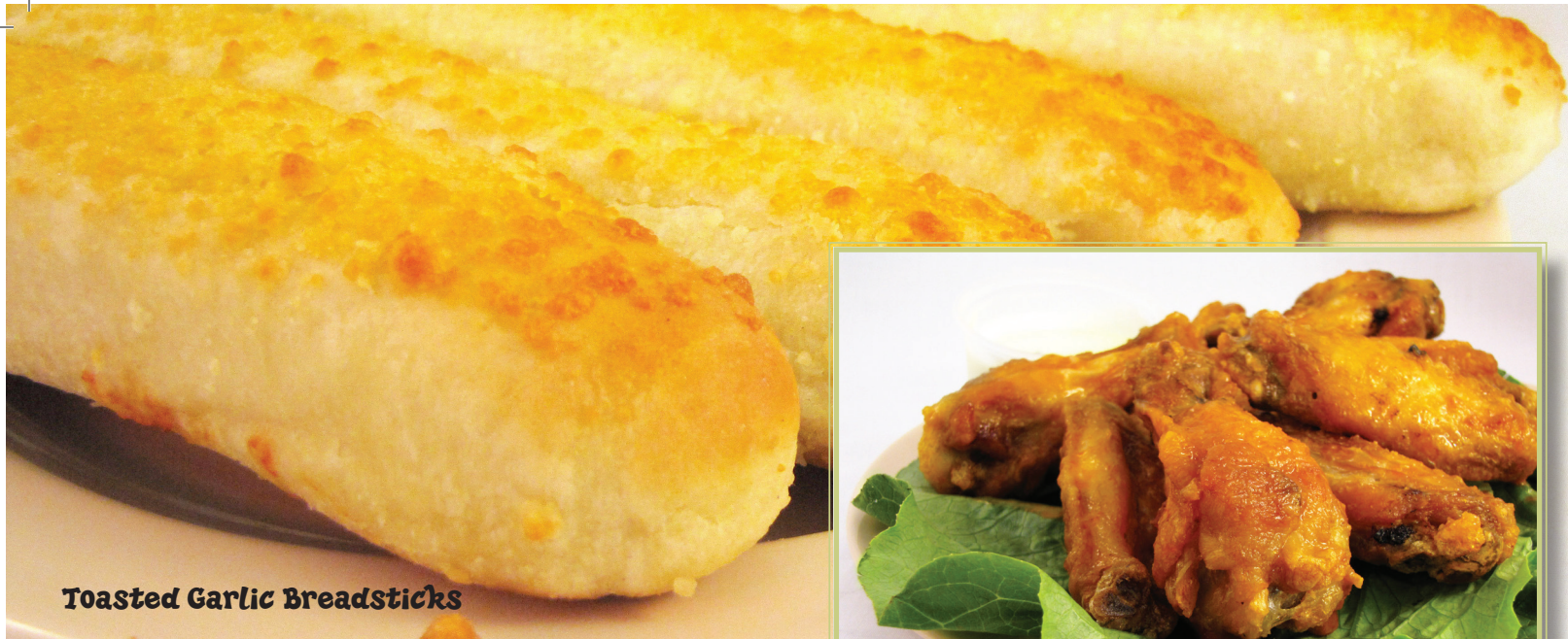
Toasted Garlic Breadsticks