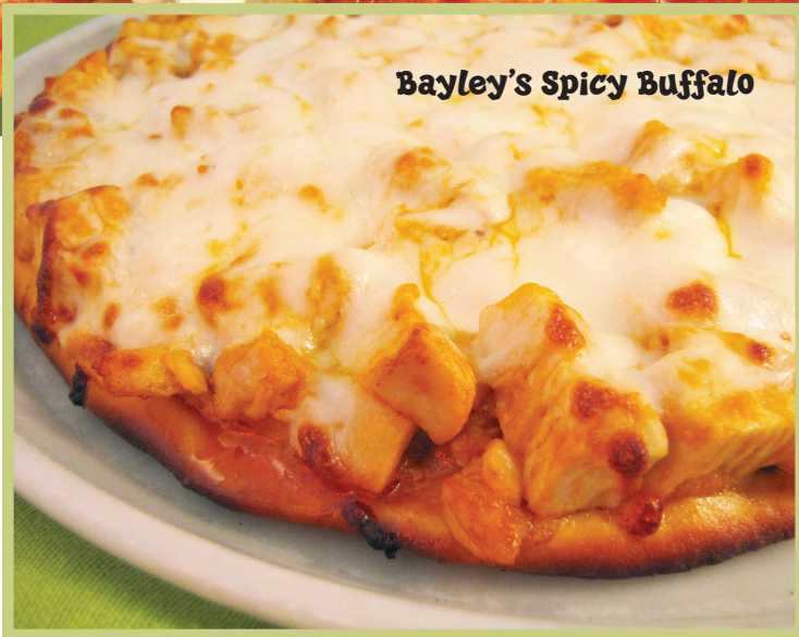
Bayley's Spicy Buffalo