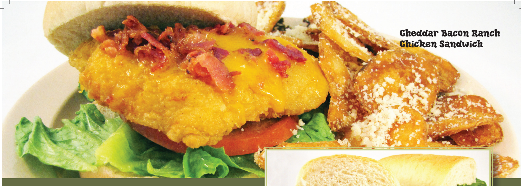
Cheddar Bacon Ranch Chicken Sandwich