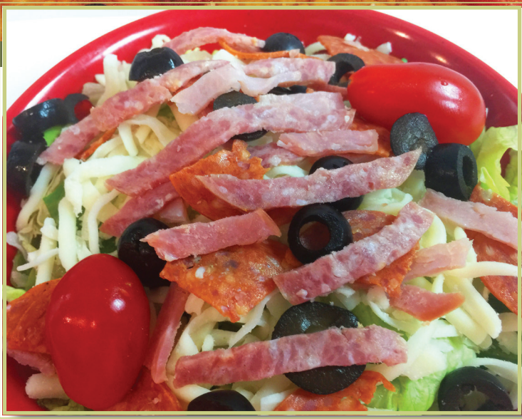
Fortel's House Salad

House mozzarella cheese and tomatoes with crisp iceberg and Romaine 4.49