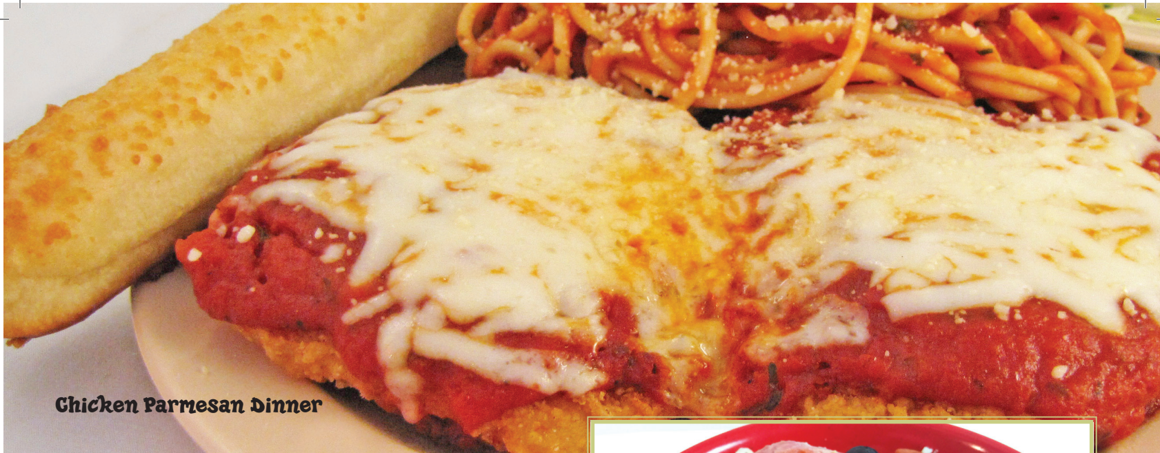
Chicken Parmesan Dinner