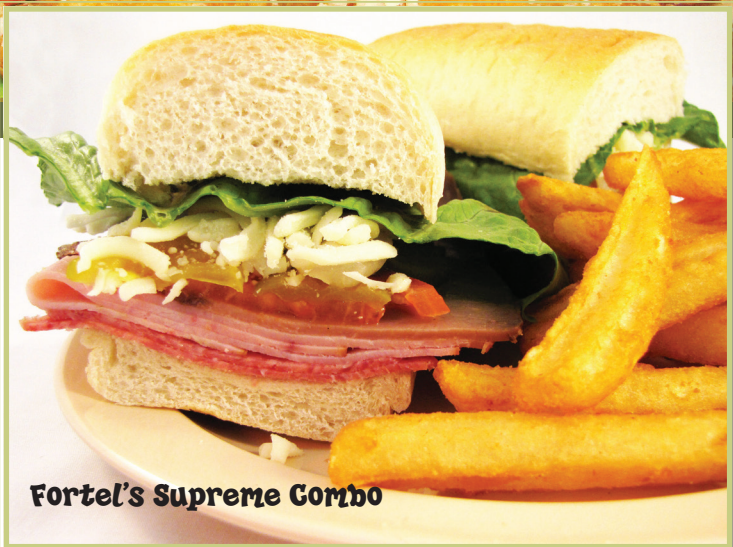
Fortel's Supreme Combo